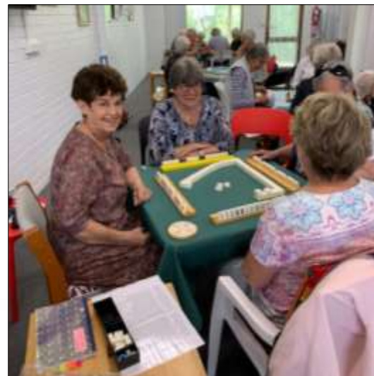
Pictured above are the girls enjoying our Monday afternoon Mahjong