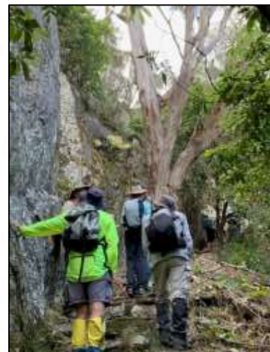
Yellow Orchids on the rocks