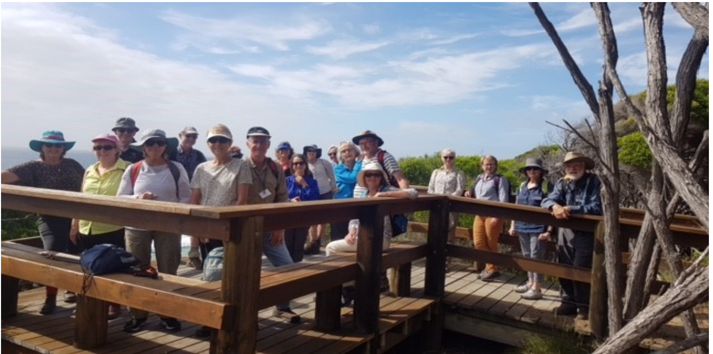
The Adventure Walking Group at Tura Beach on their final walk for 2020. Their next walk will be in February 2021.

At this time it is not possible to enrol in courses for next year. However, this facility should be available towards the end of the year. We will advise you in both the Newsletter and on the U3ASC Website when this is available. Again, you will be able to do this either on-line (with instructions for this available on the Website as above), or in person at the Tura Beach Centre Office.