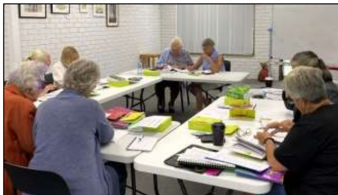
'Italian for Beginners' class (Intermediate) - cooperative learning!